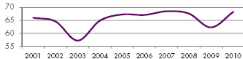
AVERAGE DAILY RATES ($) 2001-2010